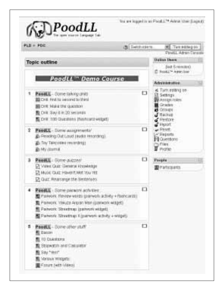
Figure 4. The POODLL demo course contents showing activities to try out.

the POODLL software is included. This allows for users to quickly assess the features of POODLL without having to develop original content for that purpose. This forwards the goal of having a self-contained, all-in-one demonstration for POODLL.