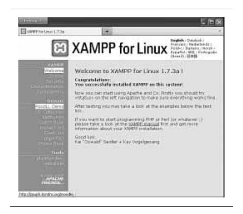
Figure 1. The main browser page showing XAMPP.

The basic user of POODLL might simply download the POODLLPUP image file and make a CD. They would then reboot the computer with the new POODLLPUP CD in the optical drive. From that point forward, the computer would become a POODLLPUP host computer, or basically a live working demonstration of the POODLL software. After opening the main browser window (see Figure 1), the user is shown the XAMPP main page.