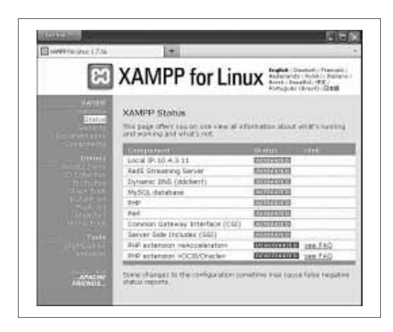
Figure 2. The XAMPP status page showing active systems.

The default settings for the web server and the POODLL installation are configured for the local host machine. From the status page, the user can see the local IP address of the machine and whether or not the systems needed to run the demo are operational. In Figure 2, the status page shows RED5 streaming active and the address on which the web server can be accessed locally. For URL and DNS configuration, the user will have to